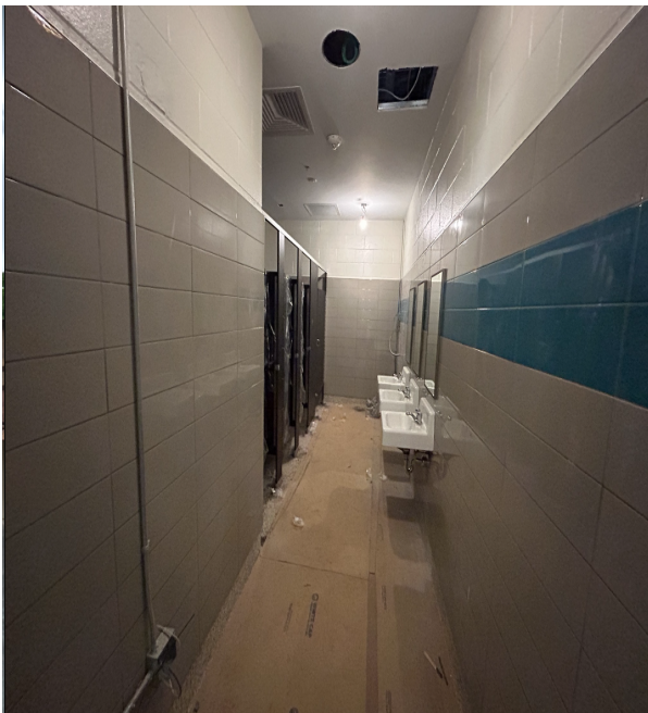
Begin installing toilet accessories and toilet compartments