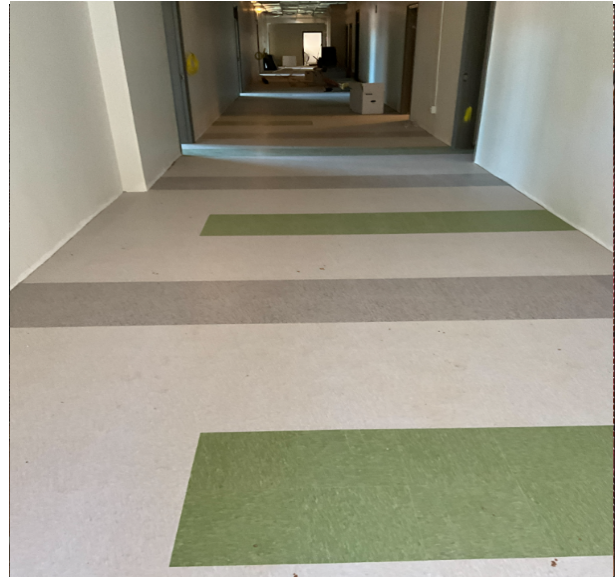
Upstairs level 2 VCT install is complete