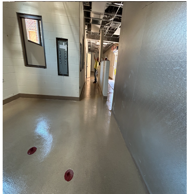
Resinous flooring in the kitchen is complete