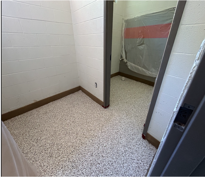
Bathroom resinous flooring is complete